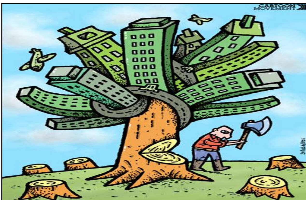
FIGURE 2.3: RESOURCES AND ECONOMIC DEVELOPMENT