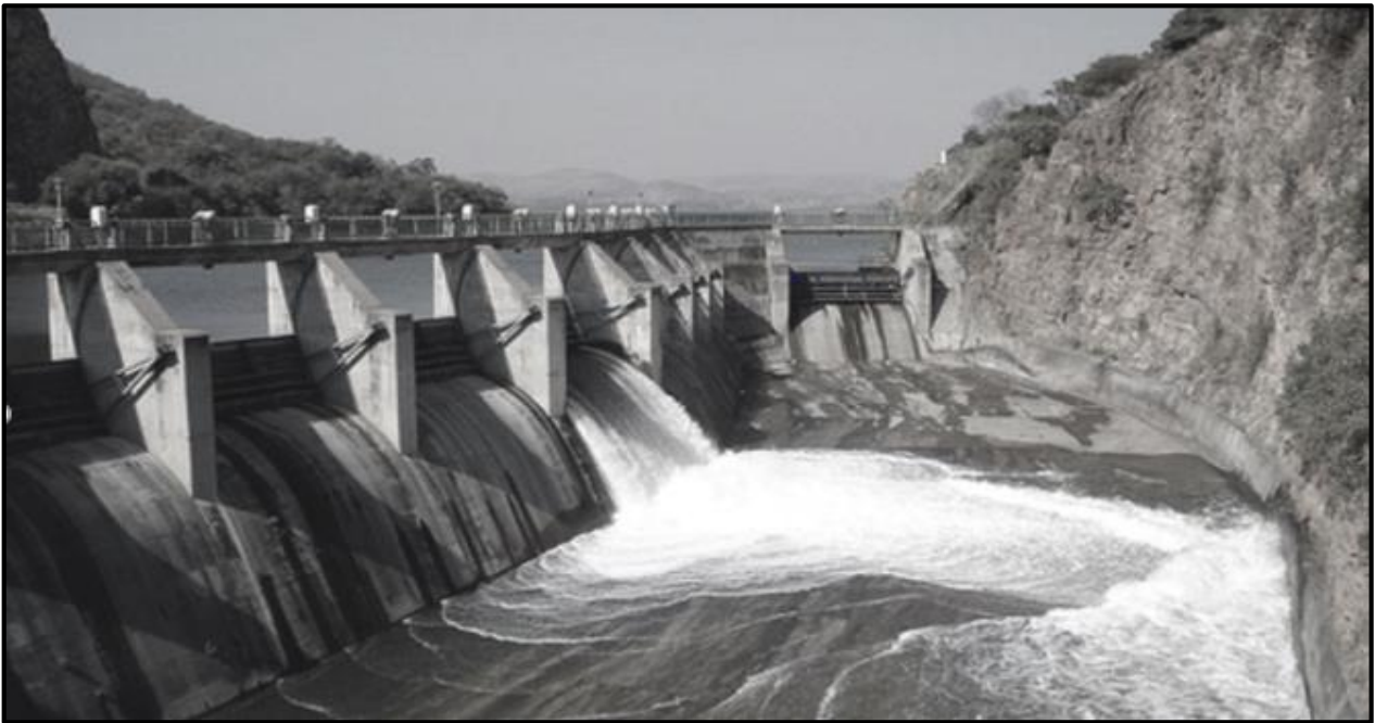
FIGURE 3.6: HARTBEESPOORT DAM WALL