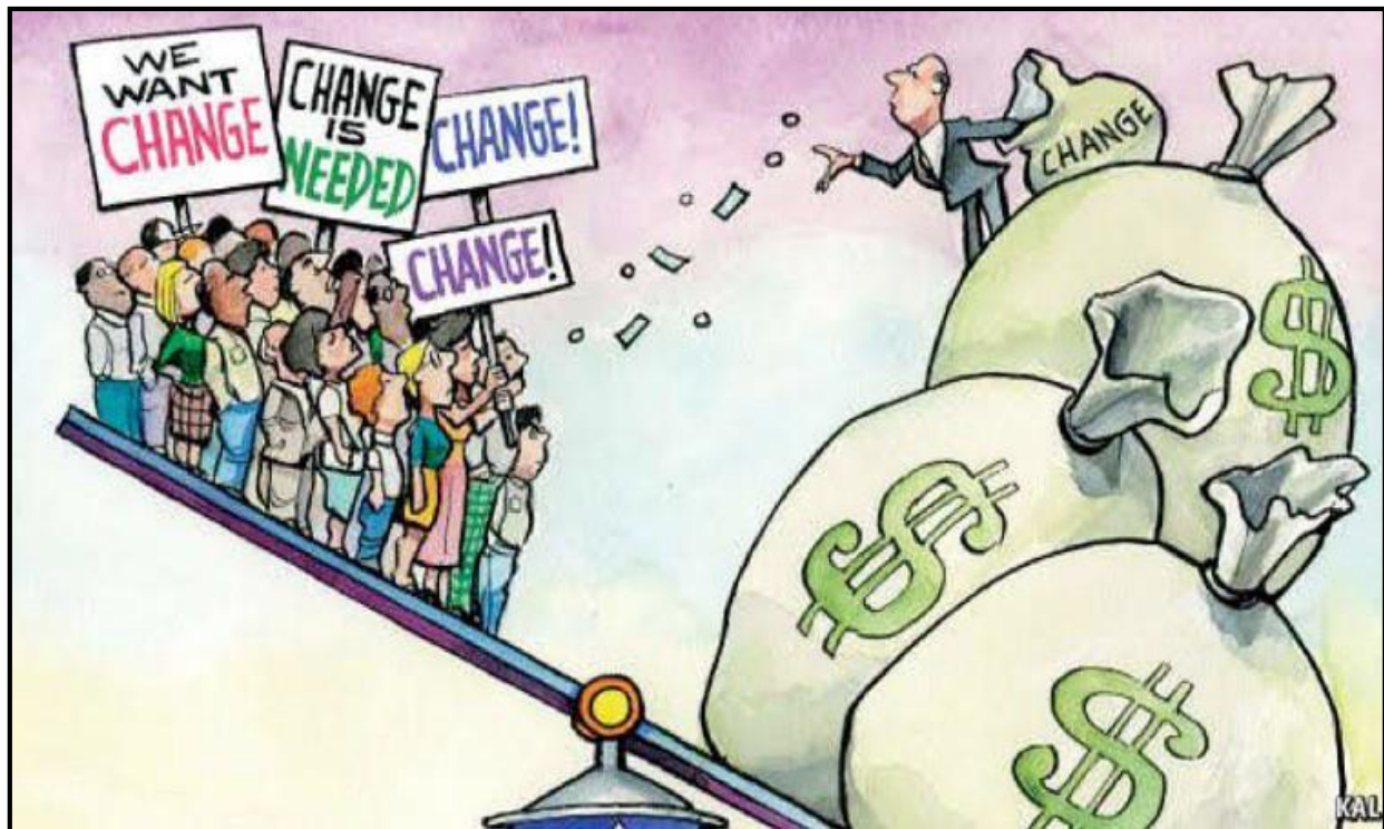
FIGURE 1.3: ECONOMIC INDICATOR OF DEVELOPMENT