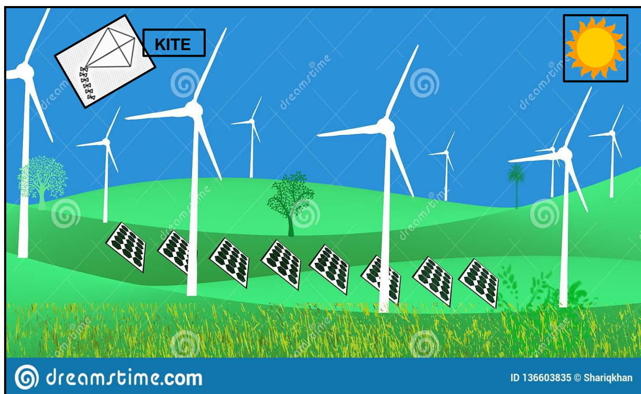
FIGURE 2.5: NON CONVENTIONAL SOURCES OF ENERGY